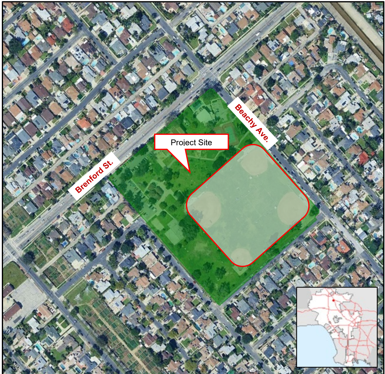
Figure 1. Project Location